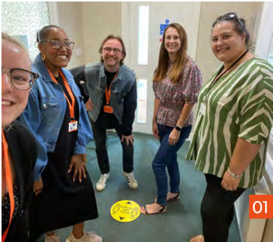
01 The Gap team