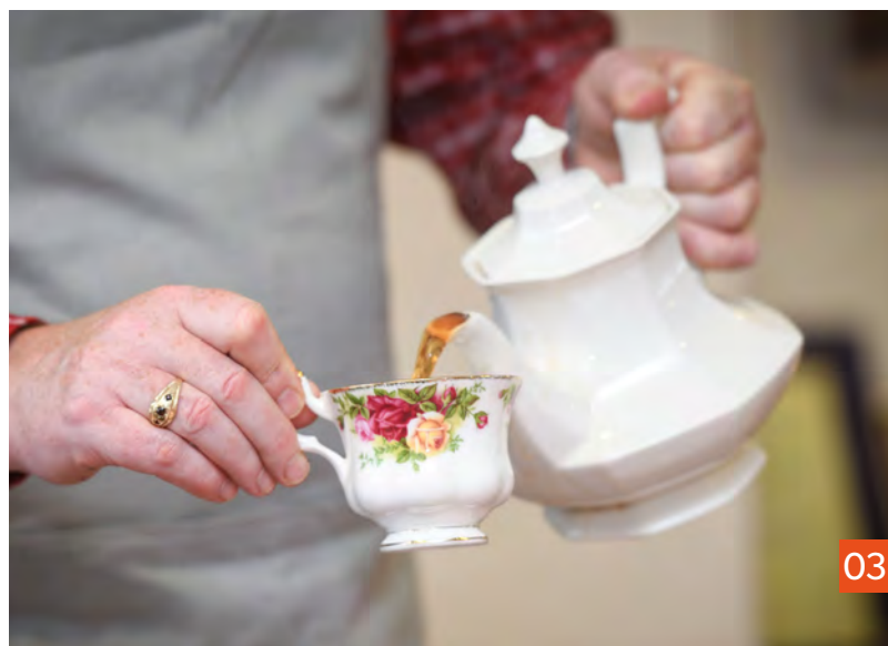
01 Lingard House Tea Party