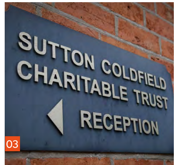
03 Sutton coldfield Charitable Trust reception