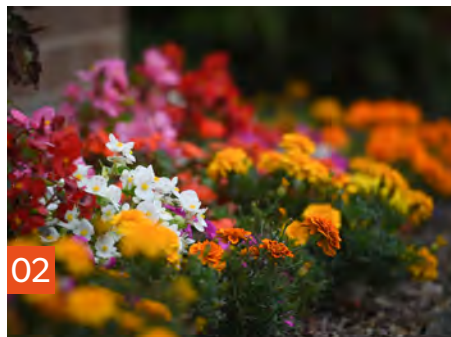
02 Lingard House in 'Bloom'