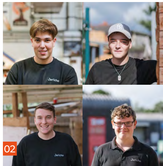
02 Jericho Apprentices

With the introduction of the Government's Kickstart Scheme and opportunities in Sutton Coldfield for improving employment, an application was submitted and approved. The objective is to further support 16 to 24 year olds on Universal Credit into work by providing them with the skills and experience required to move into newly created jobs.