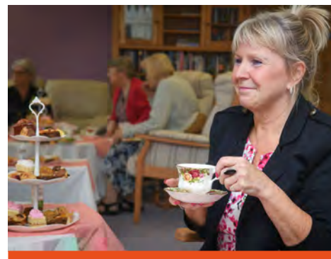
PAGE 04: ALMSHOUSES TEA PARTY