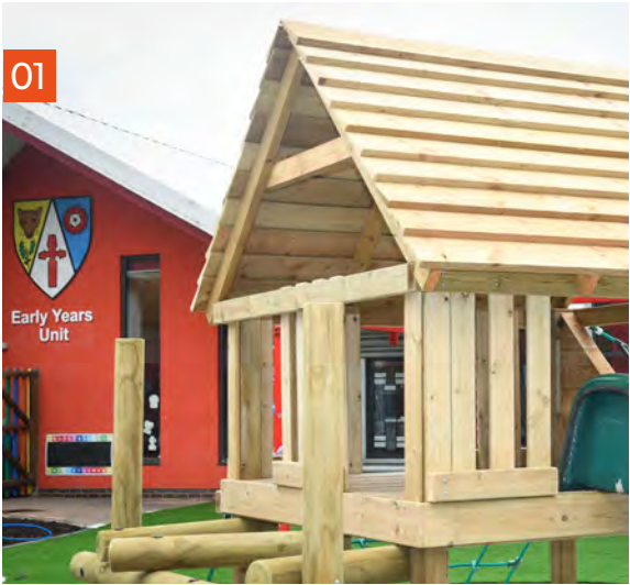
01 Deanery C. of E. Primary School

Deanery C. of E. Primary School was pleased to open its new outdoor Early Years Areas.