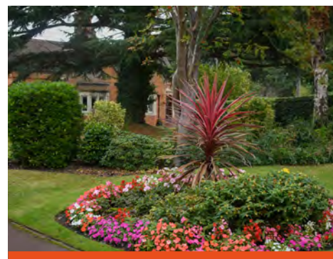
PAGE 22: WALMLEY ALMSHOUSES